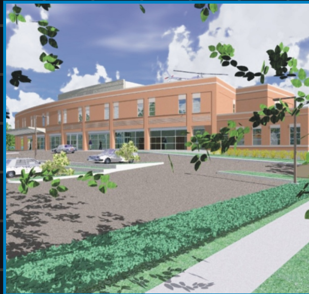
50,000-SF Hospital Addition