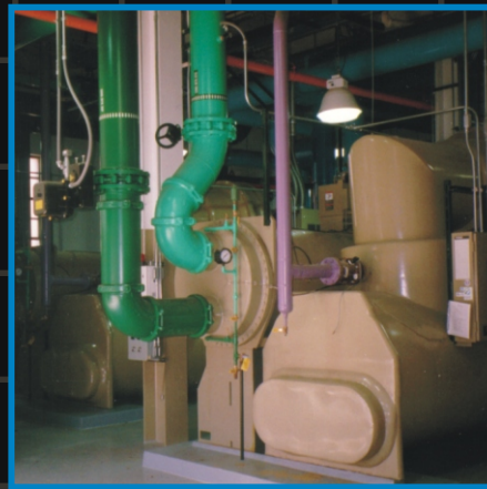
Hybrid Chiller Plant